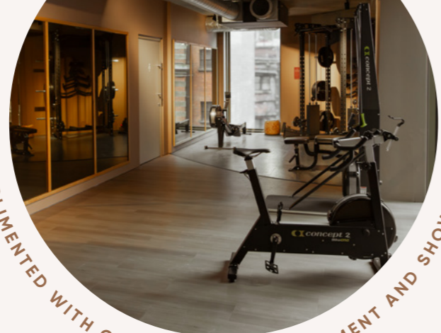
GYM COMPLIMENTED WITH CORE STRENGTH EQUIPMENT AND SHOWER ROOMS