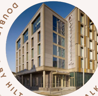
DOUBLE TREE BY HILTON 3 MINS WALK