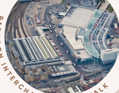
PARAGON INTERCHANGE 1 MIN WALK