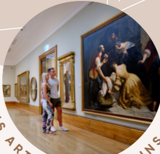
FERENS ART GALLERY 4 MINS WALK