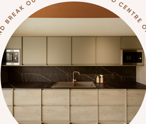
KITCHENS AND BREAK OUT SPACES FRONT AND CENTRE OF THE BUILDING