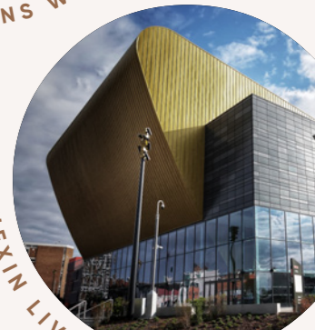
CONNEXIN LIVE 5 MINS WALK