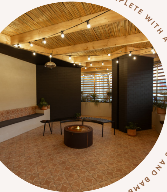
CITY GARDEN COMPLETE WITH A WATER FEATURE, PLANTS AND BAMBOO