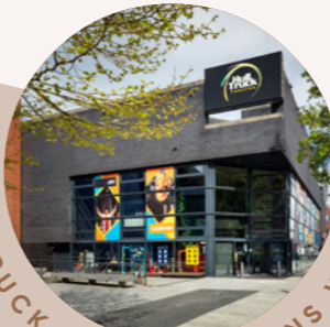
HULL TRUCK THEATRE 3 MINS WALK