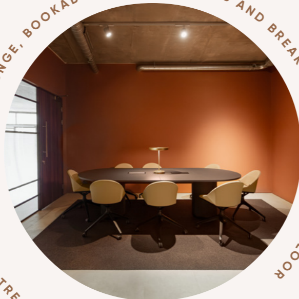
BUSINESS LOUNGE, BOOKABLE MEETING ROOMS AND BREAK OUT PODS ON EVERY FLOOR