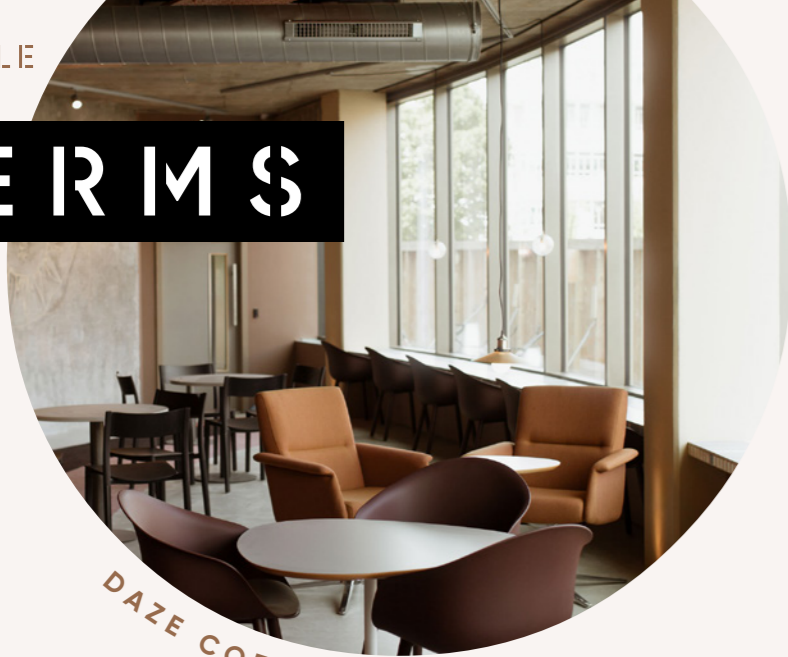
DAZE COFFEE HOUSE