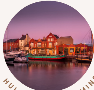
HULL MARINA 10 MINS WALK