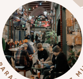
PARAGON ARCADE 3 MINS WALK