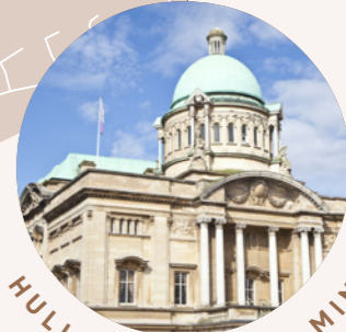
HULL CITY HALL 4 MINS WALK