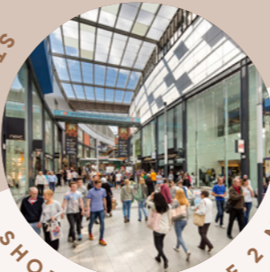
ST STEPHEN'S SHOPPING CENTRE 2 MINS WALK